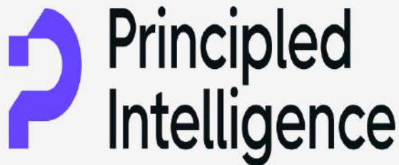
Do not distort the logo